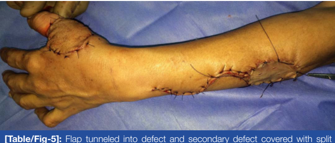
[Table/Fig-5]: Flap tunneled into defect and secondary defect covered with split skin graft.

The flap and the split skin graft were well settled on the 5<sup>th</sup> postoperative day. Microscopic examination revealed stratified squamous epithelium of skin with underlying dermis [Table/Fig-6].